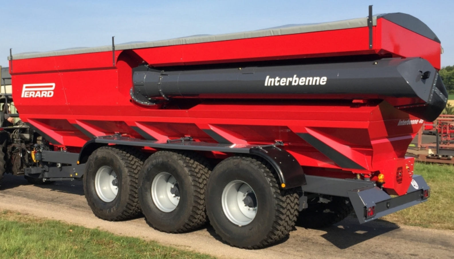
Interbenne 46 with wheels 750/60 R 30,5