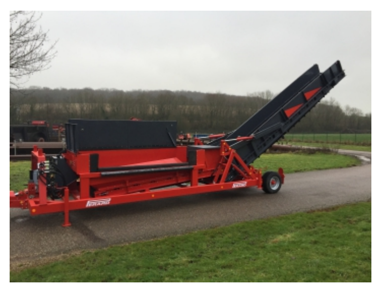
General drive by the hydraulic unit driven by the power take-off – Power required: 80 HP minimum